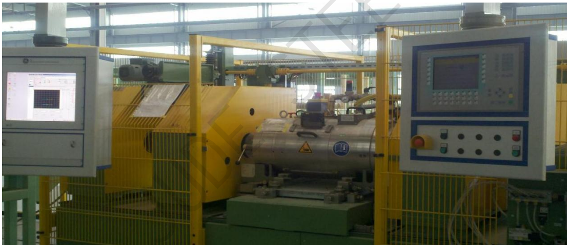
Ultrasonic and eddy current combined thickness measuring equipment