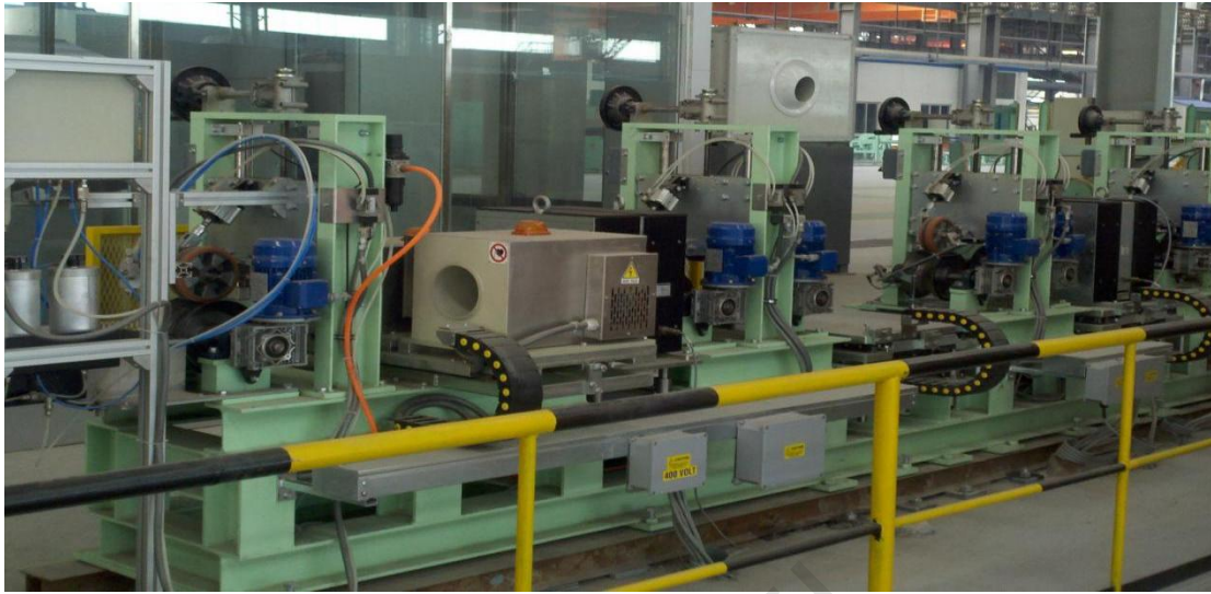
German KK online ultrasonic thickness measuring machine